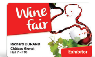
Invitations to your events